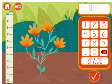
Rolling with my Gnomies